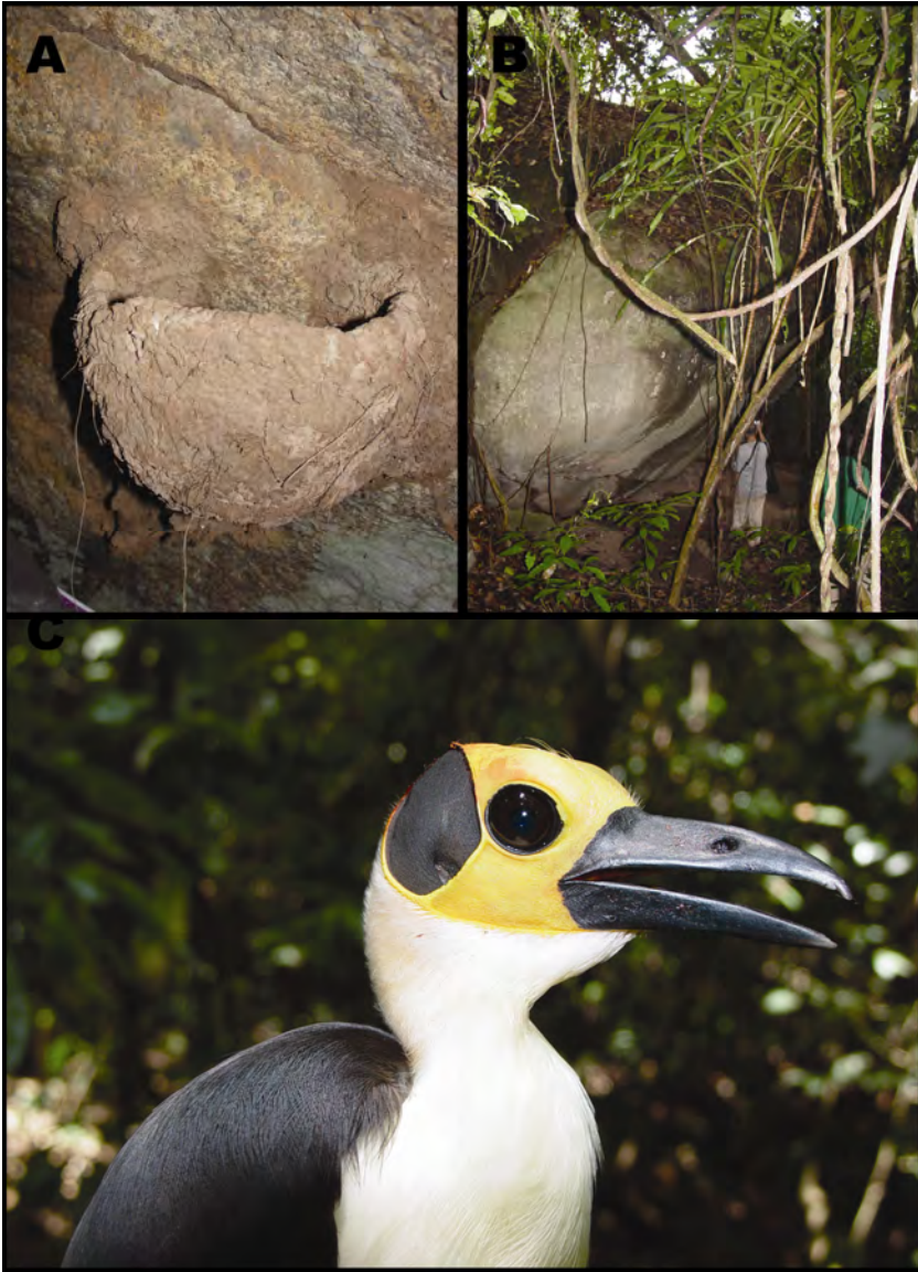
Figure 4. (A) one of two Picathartes gymnocephalus nests at (B) the overhanging boulder nest site, 30 Mar 2003; (C) a Picathartes gymnocephalus mist-netted and released on 26 Mar 2003.