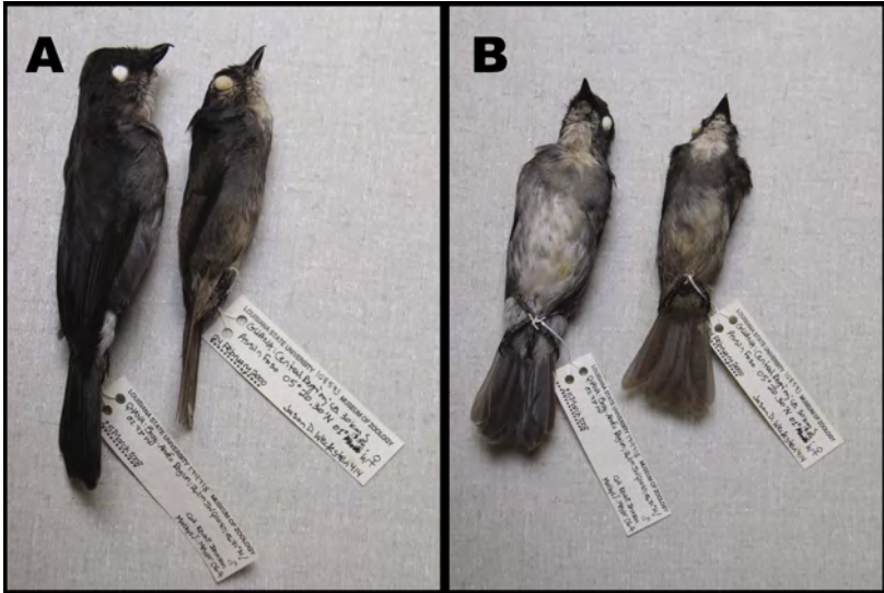
Figure 2. (A) lateral and (B) ventral views of Muscicap tessmanni (left, LSUMZ 174718) and M. comitata (right, LSUMZ 168543).